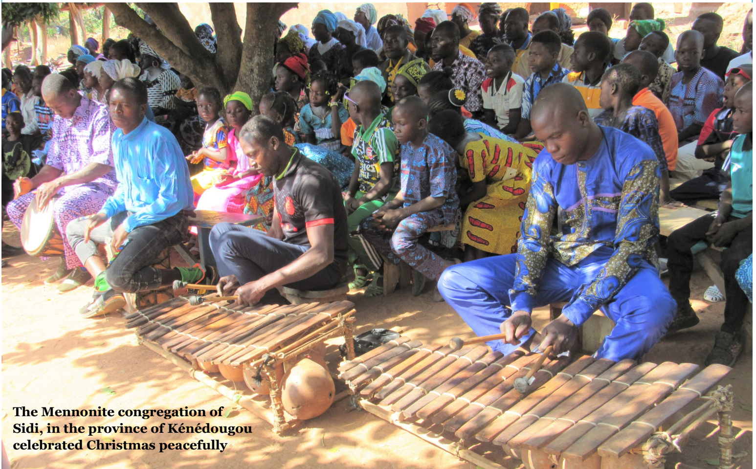
The Mennonite congregation of Sidi, in the province of Kéné Dougou celebrated Christmas peacefully