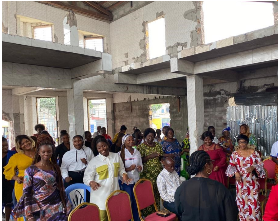
The congregation continues to worship inside the visibly damaged Kimia local sanctuary