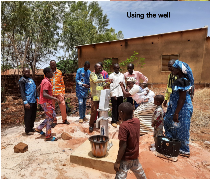
Using the well