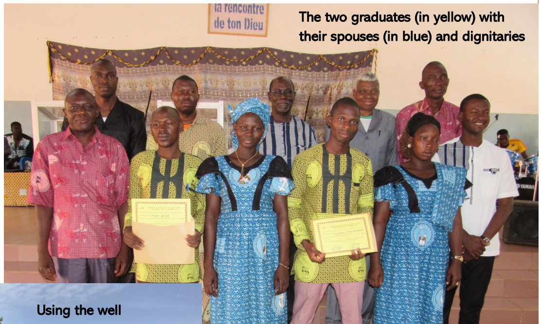
The two graduates (in yellow) with their spouses (in blue) and dignitaries