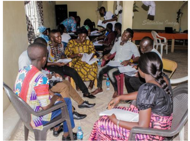
Participants in Sierra Leone discuss local resources