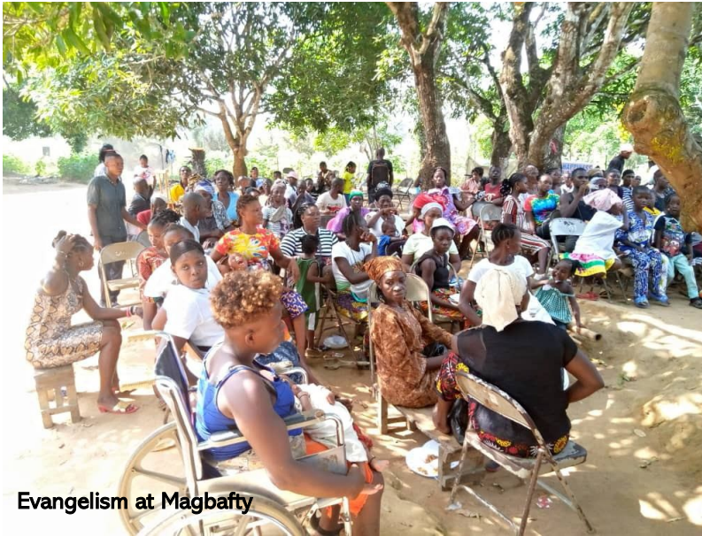
Evangelism at Magbafty