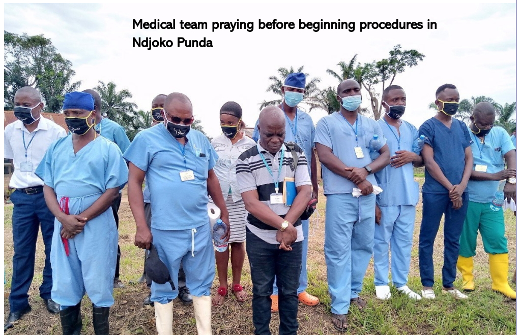
Medical team praying before beginning procedures in Ndjoko Punda