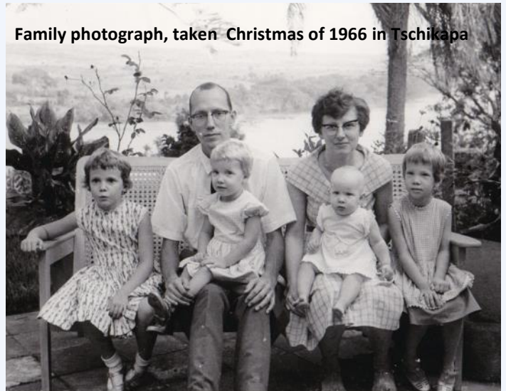
Family photograph, taken Christmas of 1966 in Tshikapa

Fern is survived by Ralph and their four married daughters, along with 22 grandchildren and many, many great-grandchildren.