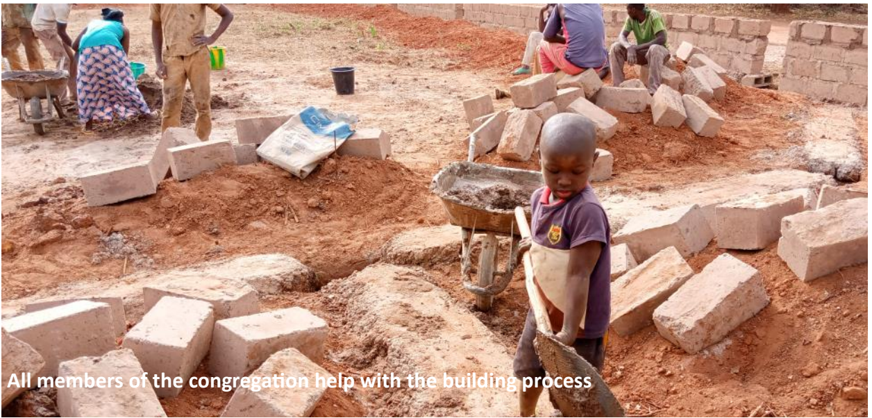
All members of the congregation help with the building process