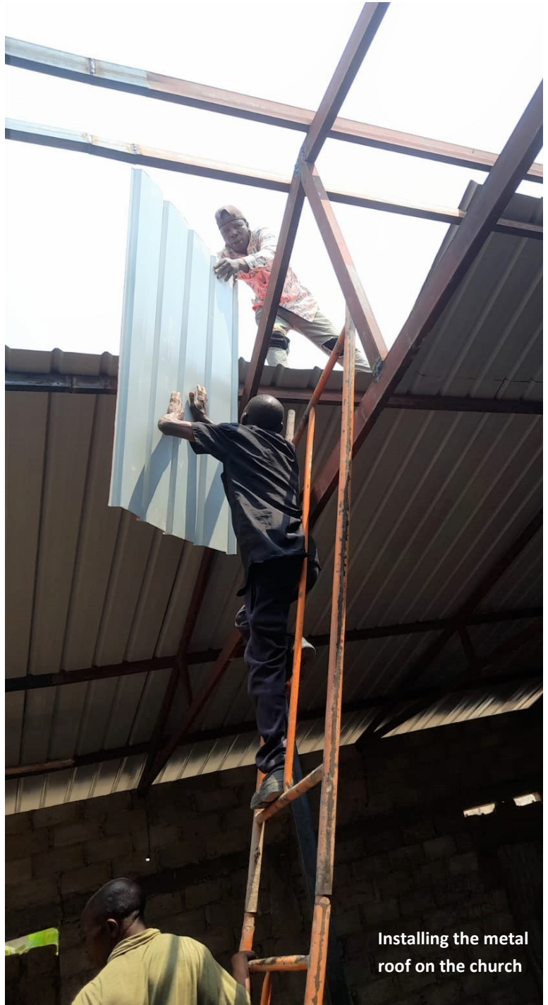
Installing the metal roof on the church