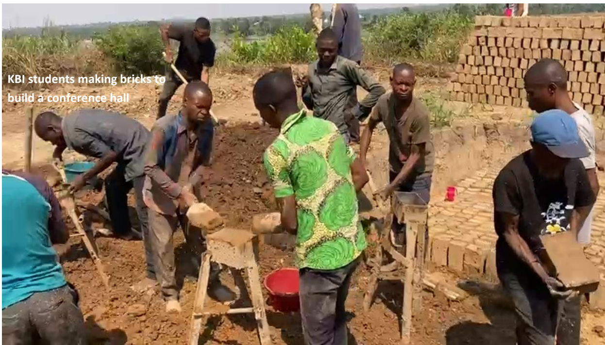
KBI students making bricks to build a conference hall