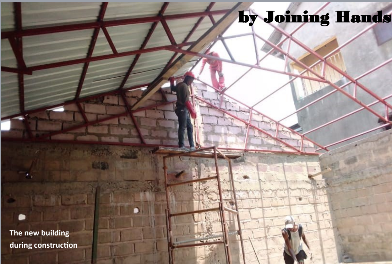
The new building during construction

A vision for collaboration among different Mennonite denominations and the need for a new place of worship has culminated in a new church building and partnership that extends across continents. Conceived originally as a congregation that would bring together members of Mennonite denominations in Kinshasa, the Colombe de MaCampagne (Dove of MaCampagne) Mennonite Church traversed several years of uncertainty as its founding members moved between temporary locations in the over-